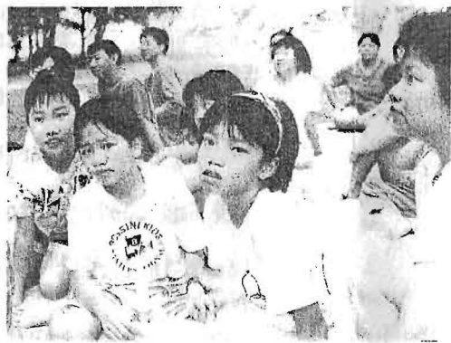
Listening intently to the instructions on the games, the children were all ready to go.