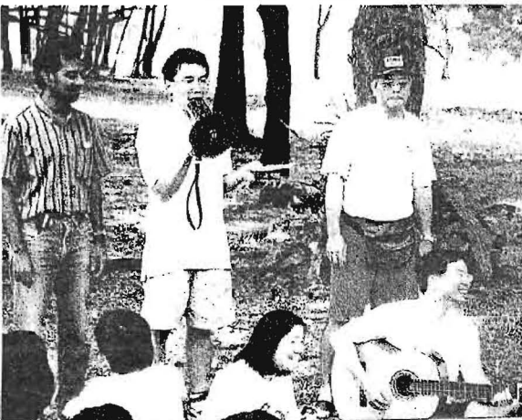
Songs and games were the order of the day, above we see the pastors leading the games and below is a section of the members singing praises to God for the fine weather.